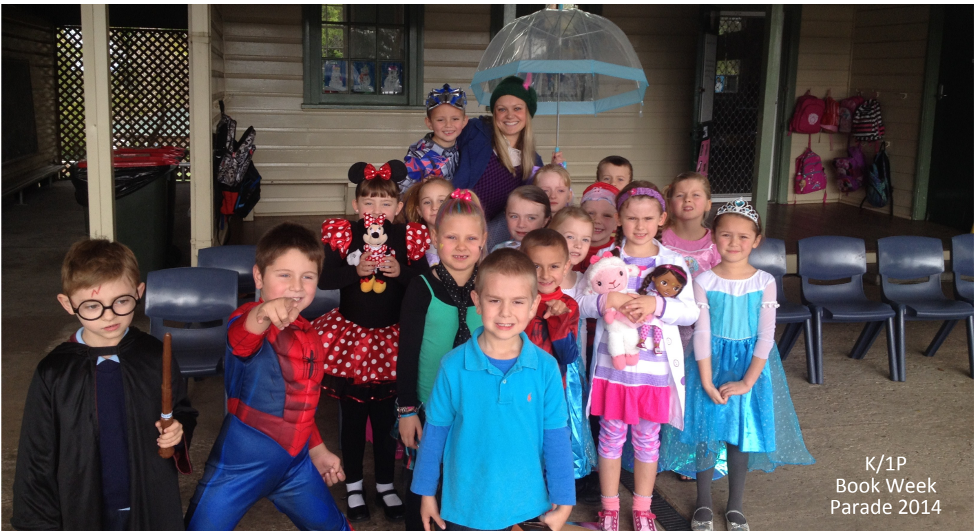
K/1P Book Week Parade 2014