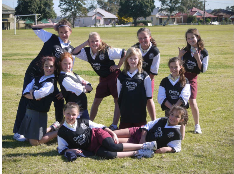
Our girl's and boy's touch football teams had a wonderful time.